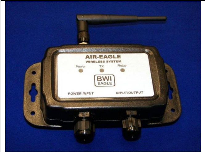
Dimensions (with mounting plate) 7.07L x 3.57W x 1.62H