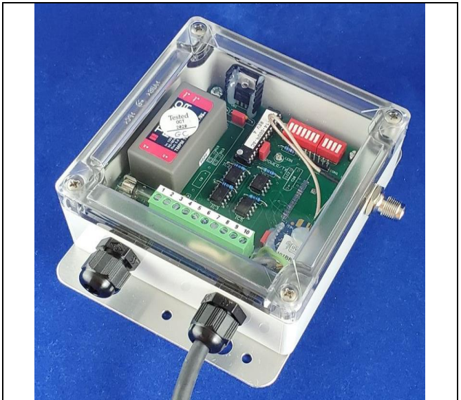
Dimensions (with mounting plate) 6.3" L x 4.8" W x 2.3" H

Transmission occurs when 120VAC is applied to the input. Transmission continues while 120VAC is present and ceases when 120VAC is removed.