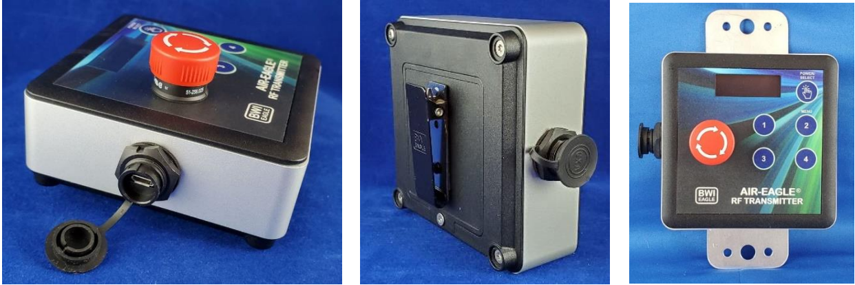
Photo on right shows unit with optional mounting plate